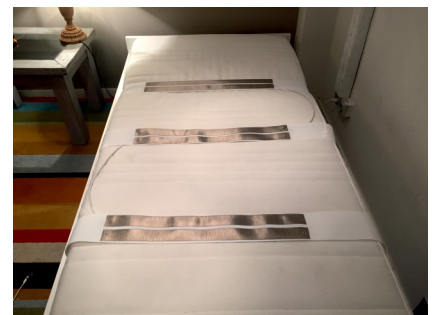
BED Multiple Sensor